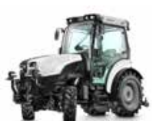
Spire S VRT Spire V VRT