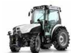
Spire F VRT