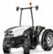
Spire F Target