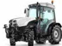
Spire S Spire V