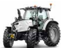
Spark 120-140 VRT Spark 120-140